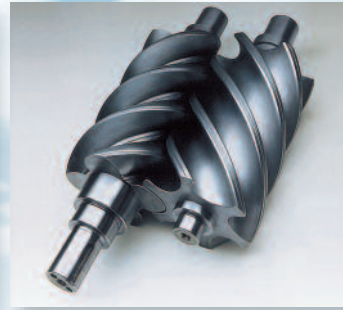
Rotary Screw Compressor by Sullair The pioneer in rotary screw technology.