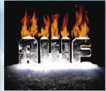
Sullair AWF Compressor Fluid Improved hot and cold weather lubrication. Longer compressor fluid life. Extended air end warranty.